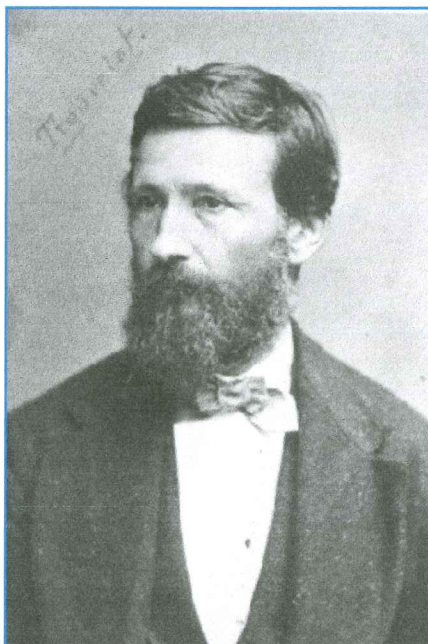
E. Leopold Trouvelot

The population of gypsy moth caterpillar exploded during the spring of 1889. The year before had been a good one for insects, and gypsy moths had flourished and laid record numbers of eggs. Hatching in April and May of 1889, millions of gypsy moth caterpillars stripped leaves from trees yard after yard and street after street in Medford. Caterpillars covered tree trunks, fences, and sides of houses.